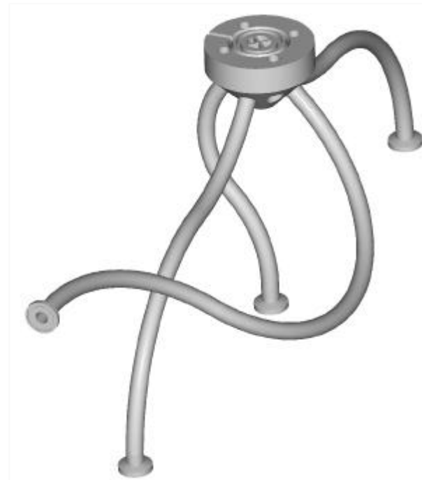
Piping base with tubes for discharge side