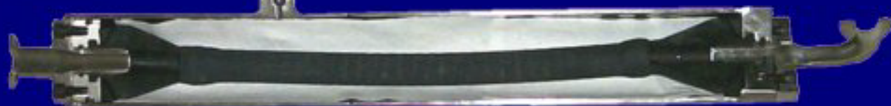
With PermaCushion foam fill.